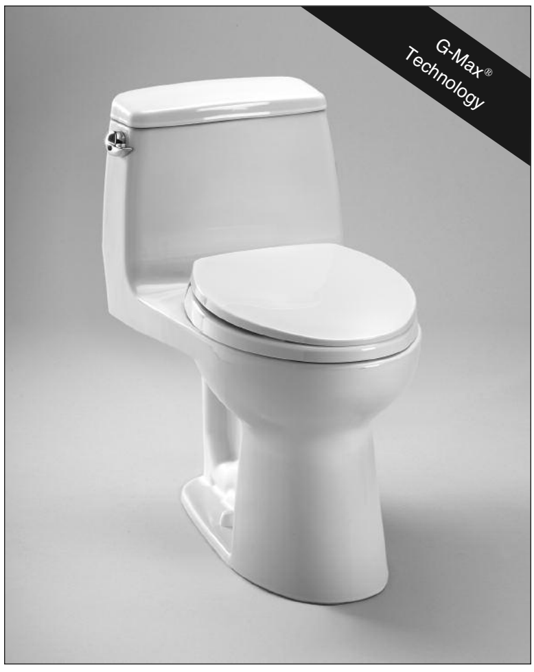
MS854114SL - Ultramax® ADA Height Toilet with SoftClose® Seat