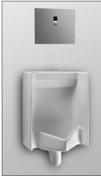
UT447EV Back Spud Urinal TEU2LN11#SS 0.5GPF Eco EFV (flush valve will launch second half of 2008)