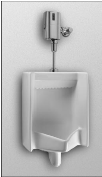
UT447E Top Spud Urinal TEU1LN12#CP 0.5GPF Eco EFV