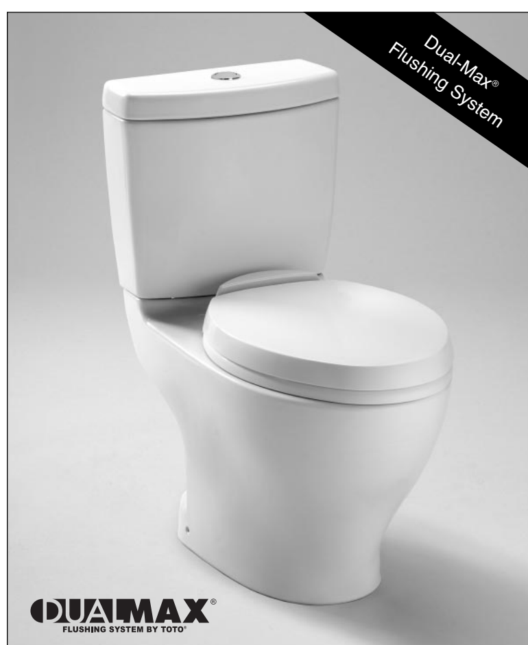
CST416M - Aquia® II Toilet SS204 - SoftClose® Oval Seat