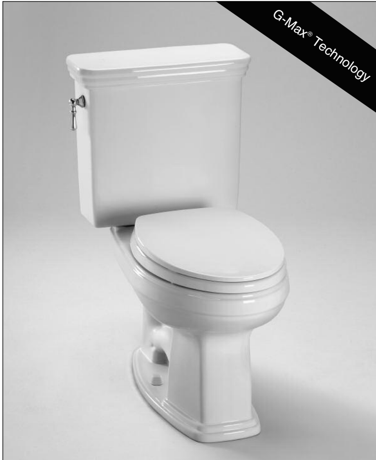
CST424SF - Promenade Toilet SS114 - SoftClose Seat