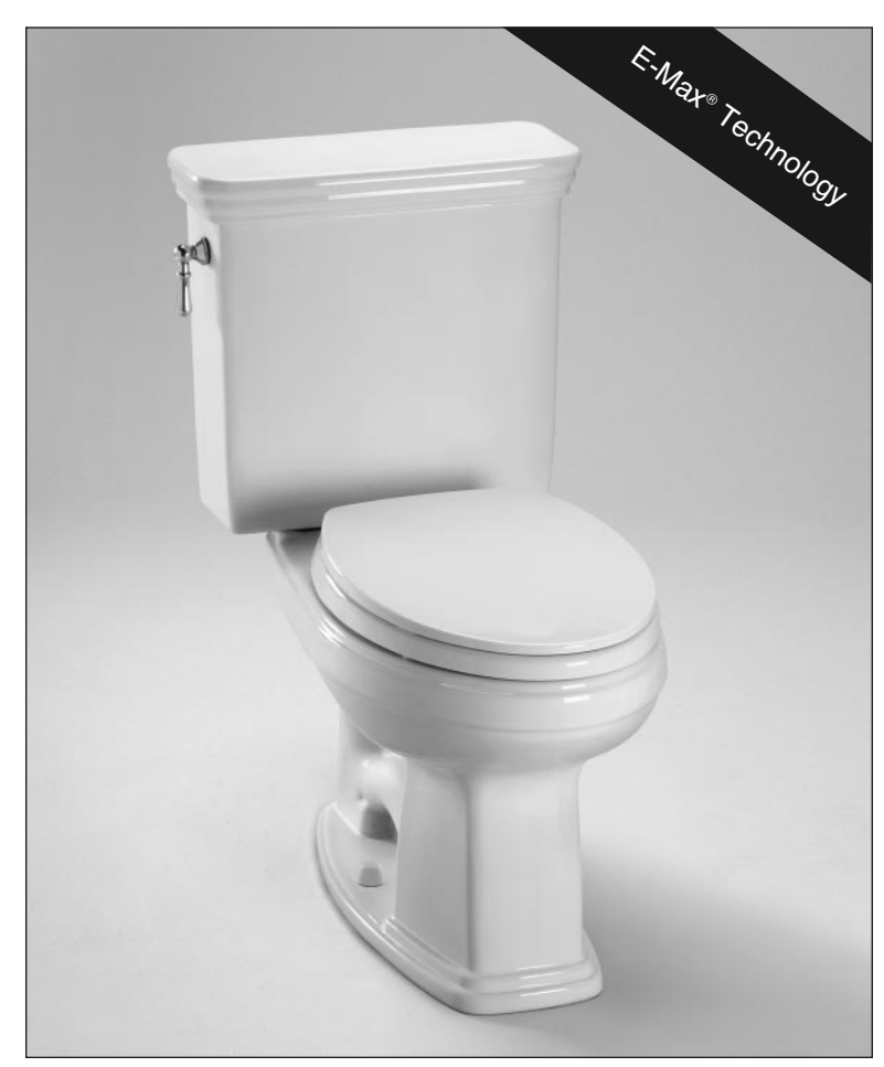
CST424EF - EcoPromenade Toilet SS114 - SoftClose Seat