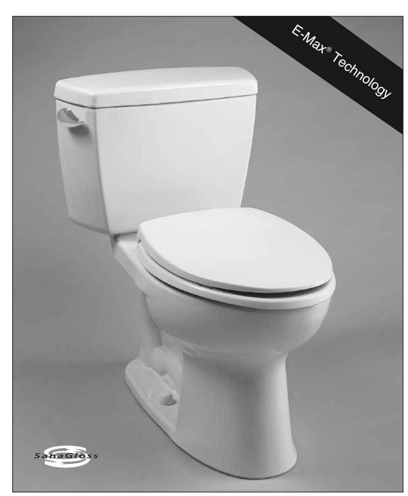
CST744E(G) - Eco Drake® Close Coupled Toilet with SS114 - SoftClose® Seat