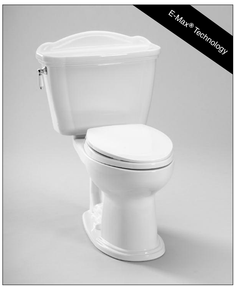
CST754EFN - Eco Whitney® Close Coupled Toilet with SS154 - SoftClose® Traditional Seat