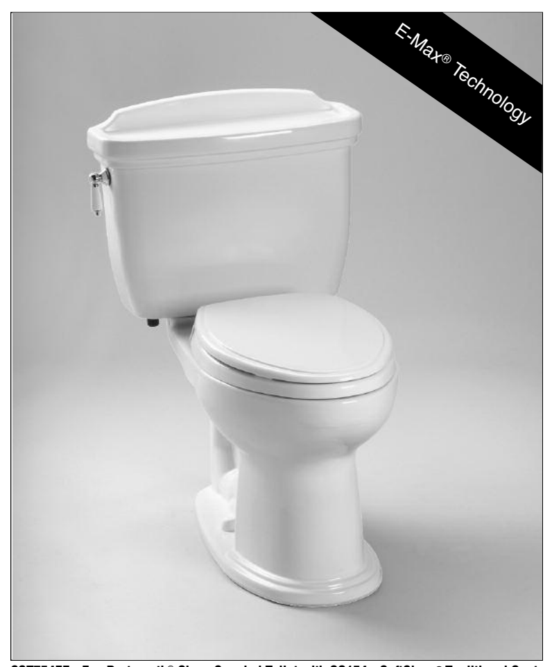
CST754EF - Eco Dartmouth® Close Coupled Toilet with SS154 - SoftClose® Traditional Seat