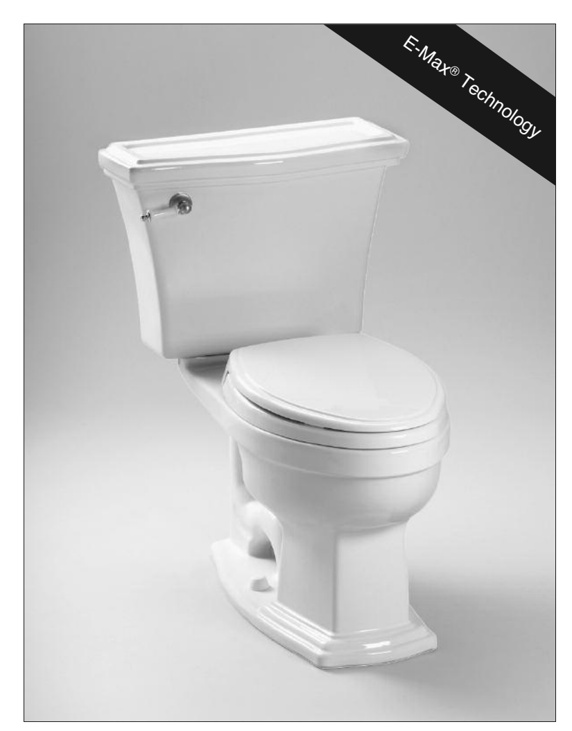
CST784EF - Eco Clayton<sup>®</sup> Toilet with SS154 - Traitional SoftClose Seat