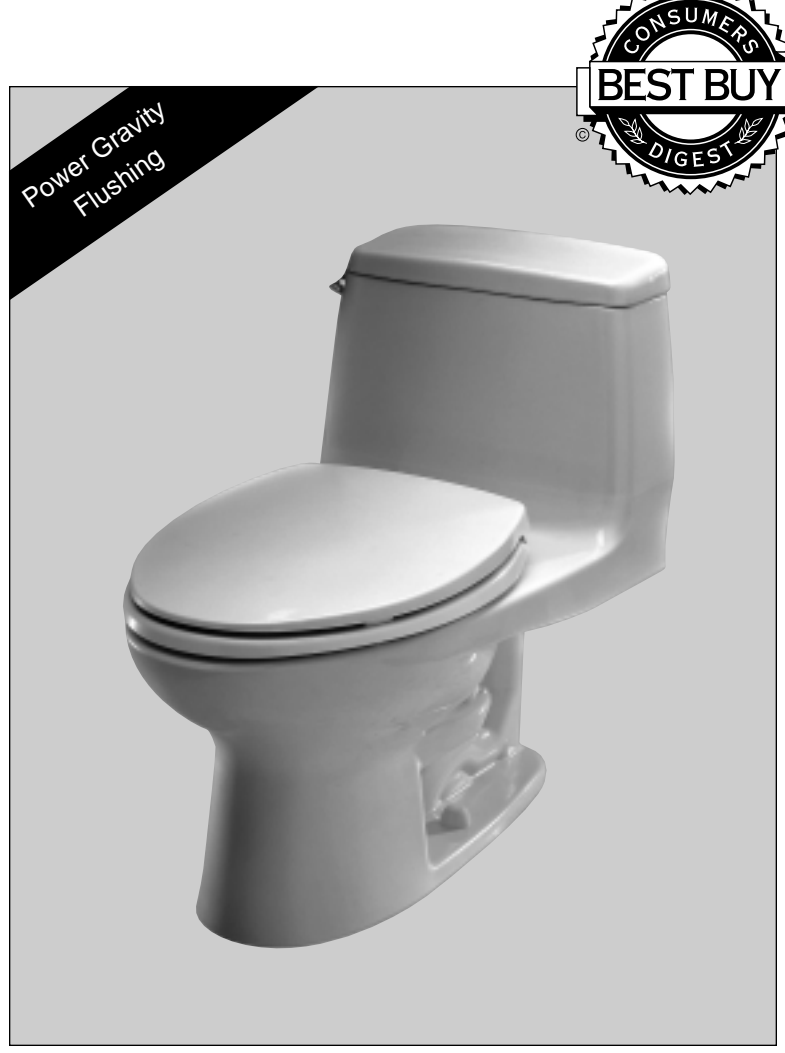
MS854114 - Ultimate Toilet with SoftClose Seat