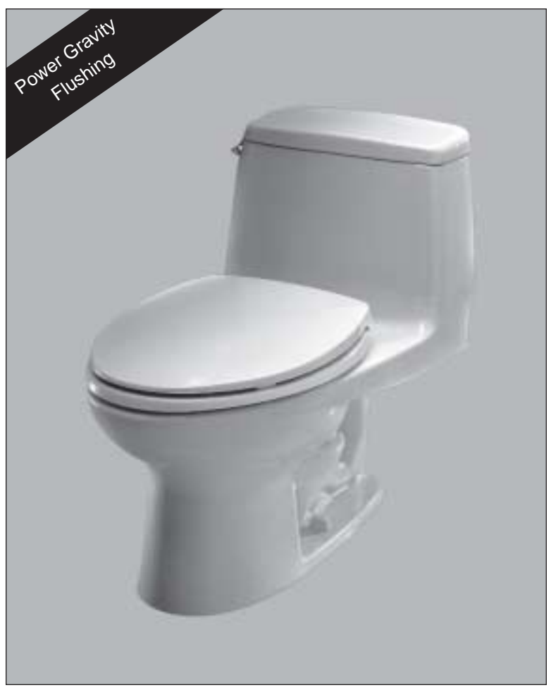
MS854114 - Ultimate Toilet with SoftClose Seat