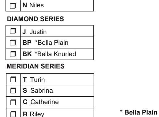
3. To Be Specified : Color