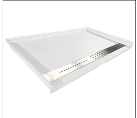
SMFTD Trench Drain Base