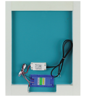
UL Approved Includes power supply and hardware. Adaptable for wall switch or touch on/off sensor on mirror